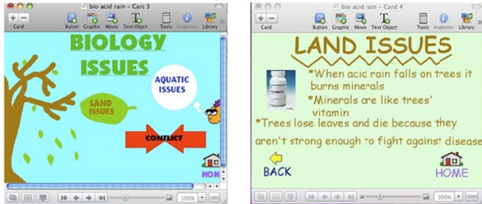
Figure 2. Biology partners' audio sign use.

The first slide is the biology home slide, which outlines all the biology issues with acid rain that the reader could learn about, such as land and aquatic issues or the conflict between acid rain and the environment. When readers clicked on the “Land Issues” leaf (i.e., button), readers would hear the trumpeting sound of an elephant; this led readers to the slide that discussed Land Issues. Interestingly, the information on the slide explained how acid rain impacted the minerals trees need to survive.