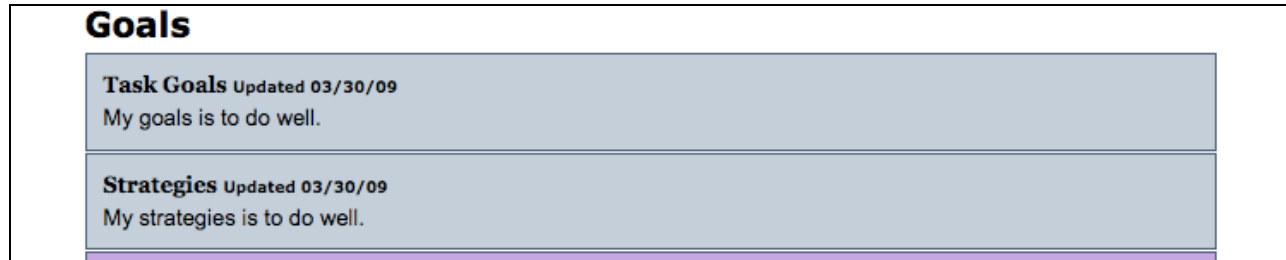
Figure 6: Example of Scott’s Task Goals and Strategies, Demonstrating Low-Level, “Beginning” Level of SRL

retrospectively. Figure 6 illustrates how a beginning goal or strategy may look. Students who use basic explanatory statements such as ‘to do well’ are providing very vague details and lower level self-regulatory skills.